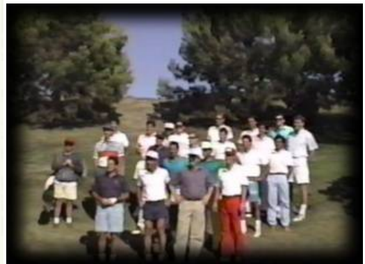
The 1989 Field After the Round